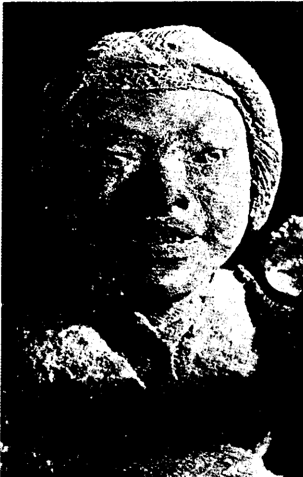
Examples of ceramic figurines from the Early Xochipala period.

“where and when” of their origin remain to be determined, perhaps in this period of the Xochipala complex itself.